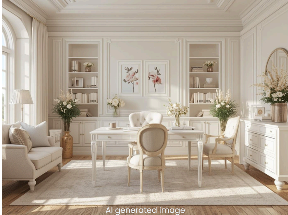
AI generated image

We often forget that the word of God is alive and active (Hebrews 4:12). That means when you read the word of God you should expect it to challenge the beliefs you have, to disrupt the order in your life, to rattle the foundation that you've build your convictions on. The word is going to do a work in you that will not be pretty, that won't be comfortable, easy, simple, or enjoyable.