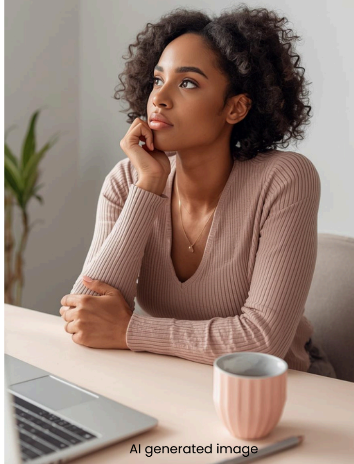
AI generated image

But I realised that many of us are not genuinely interested in healing those wounds. We decided to sit in the judgement seat and want to council God on how He should avenge us for these horrendous things done to us. We are not asking God to give us the grace to forgive because we feel justified in withholding our mercy until we are avenged to our satisfaction. Given the chance, we'd gladly declare Psalm 58:6-10.